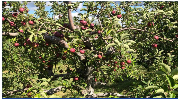
Apple orchards are a perfect place to visit in the fall. On September 19th, the residents of the Blaire House Milford will visit Fairmount Fruit Farm in Franklin. The residents will have the chance to see goats and take in the sights and sounds of the farm and fall season.