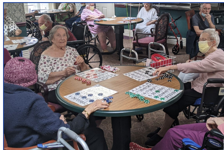
B-I-N-G-O! Have I mentioned this activity is their favorite????