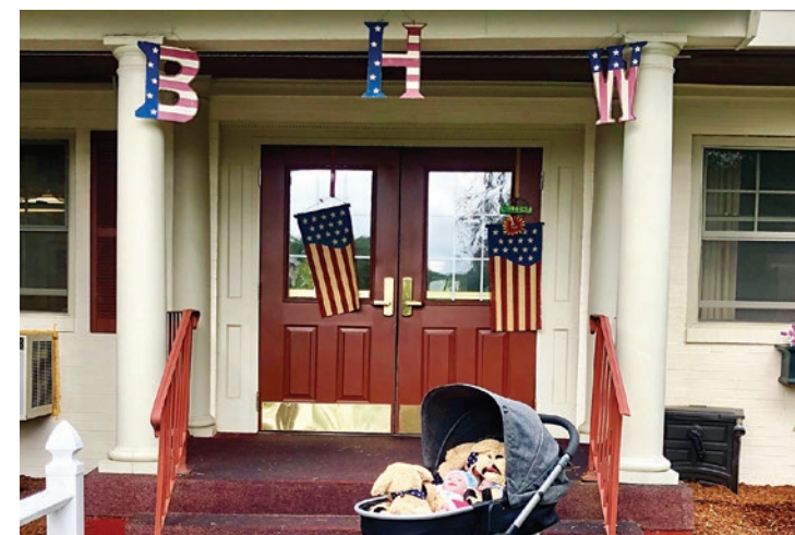
A display of dolls and puppies from Littles2Luv in a vintage baby carriage.