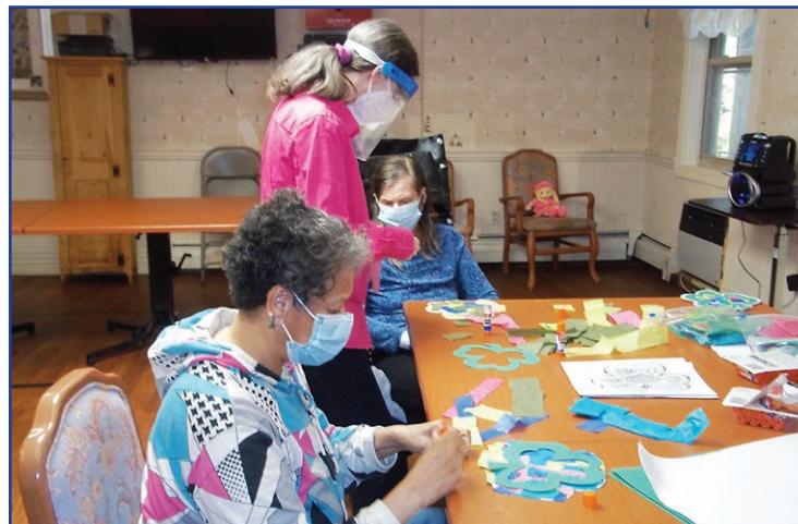
Residents decorating shamrocks for St. Patrick's Day.