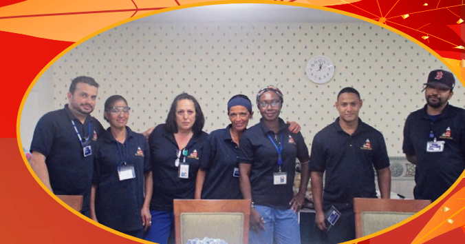
Our laundry/ housekeeping recognition luncheon.