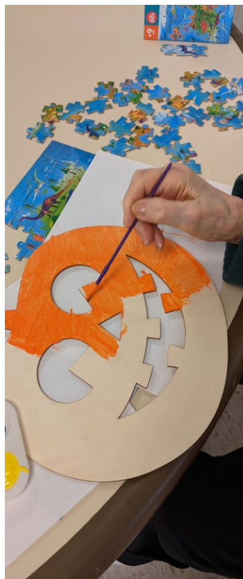
A resident painting a pumpkin for Halloween.