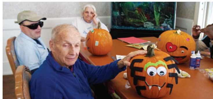
Some of our residents showing off their creative skills in pumpkin decorating.